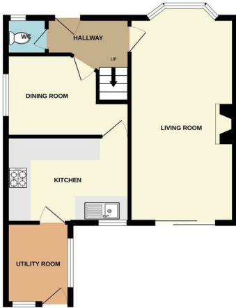
GROUND FLOOR 515 sq.ft. (47.9 sq.m.) approx.